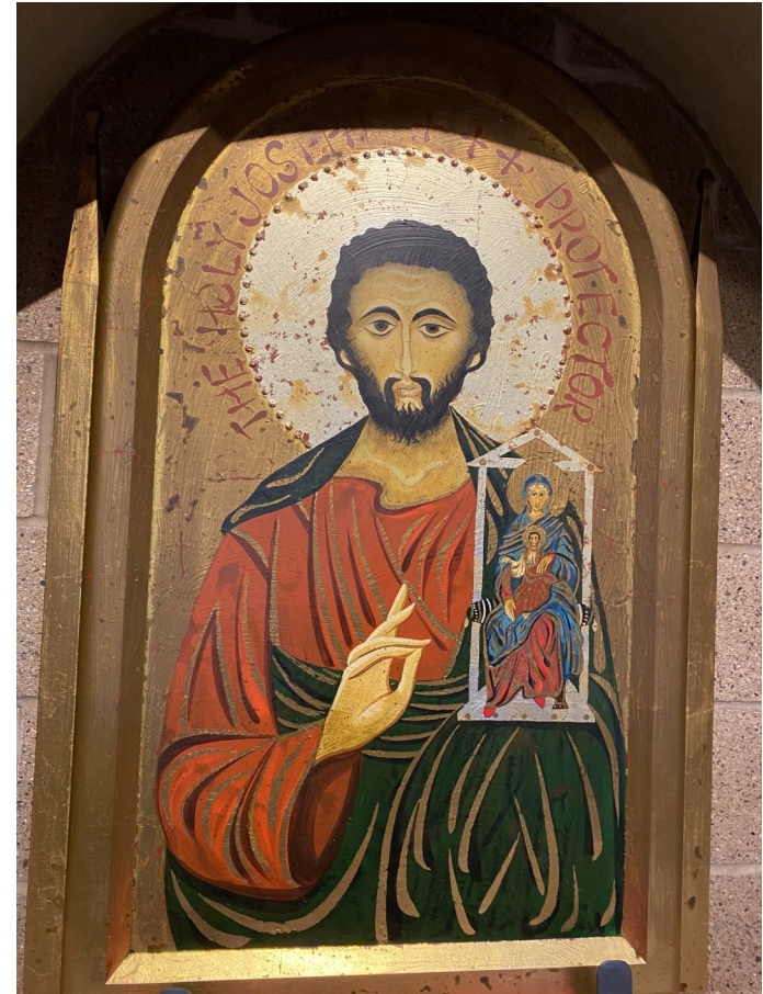
St. Francis of Assisi Catholic Church

Reflections, Prayers, Devotions, and Consecration to St. Joseph